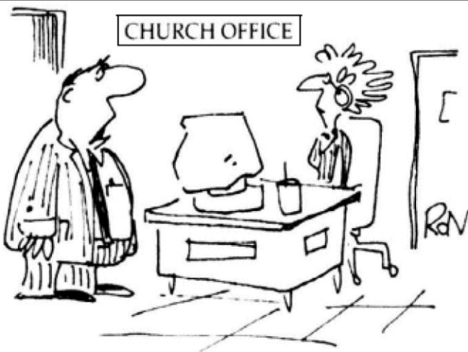
"If telemarketers call, invite them to church."