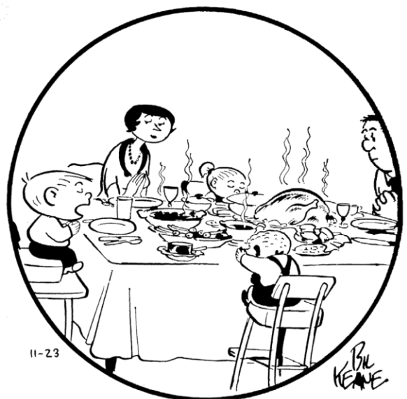
"Thank you for everything but the broccoli!"